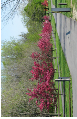
Creekside park is located on 68th St SE just 2 miles east of US 131